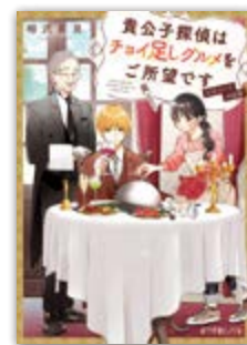
Vol.3 The Noble Detective Requests a Dash of Gourmet The Secret of the Illusory Soup