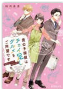
Vol.2 The Noble Detective Requests a Dash of Gourmet Enchanted Recipes Smell of Incidents