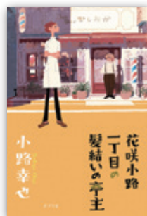
The Hairdresser in Hanasaki Street District 1