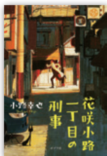
The Detective of Hanasaki Street District 1