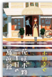
The Portrait Studio in Hanasaki Street District 2