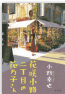
Kanoko of Hanasaki Street District 2