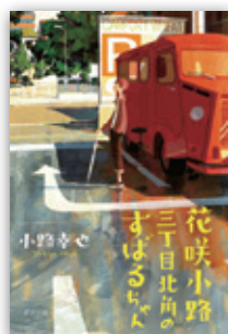
Subaru-chan in the North End of Hanasaki Street District 3