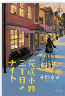
Café Night in Hanasaki Street District 3