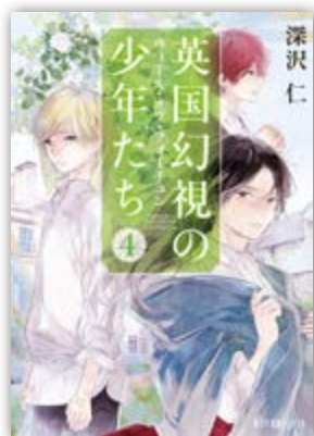
Vol. 4: Wheel of Fortune