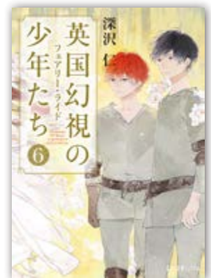
Vol. 6: The Return of the Shepherd