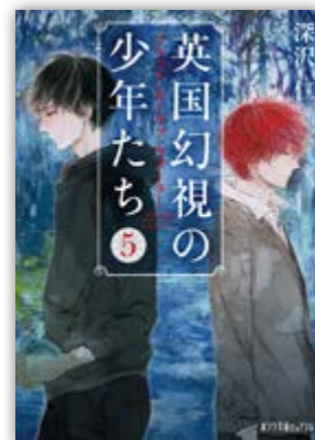
Vol. 5: Blood over Water