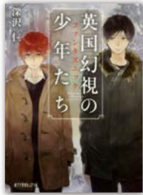
Vol. 1: Phantasnic