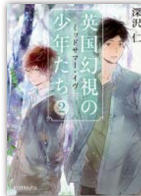
Vol. 2: Midsummer Eve