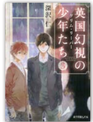
Vol. 3: Farewell, My Ghost