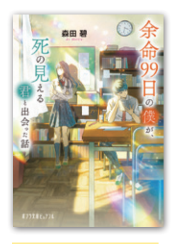
➡ English synopsis and sample are available.

paperback Pub month: Jan. 2021 ISBN 978-4-591-16889-9 148mm x 105mm 300 pages Rights sold: Korean and Thai