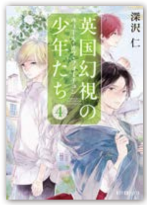
Vol. 4: Wheel of Fortune