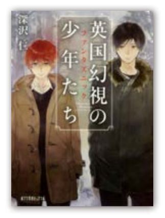
Vol. 1: Phantasnic