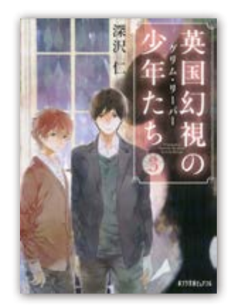
Vol. 3: Farewell, My Ghost