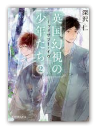
Vol. 2: Midsummer Eve