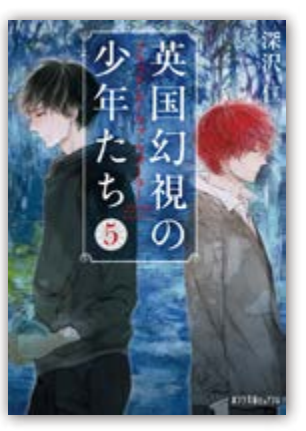
Vol. 5: Blood over Water