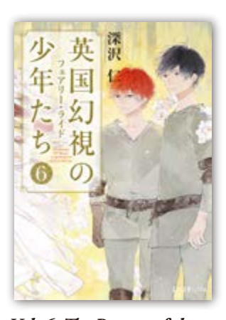
Vol. 6: The Return of the Shepherd